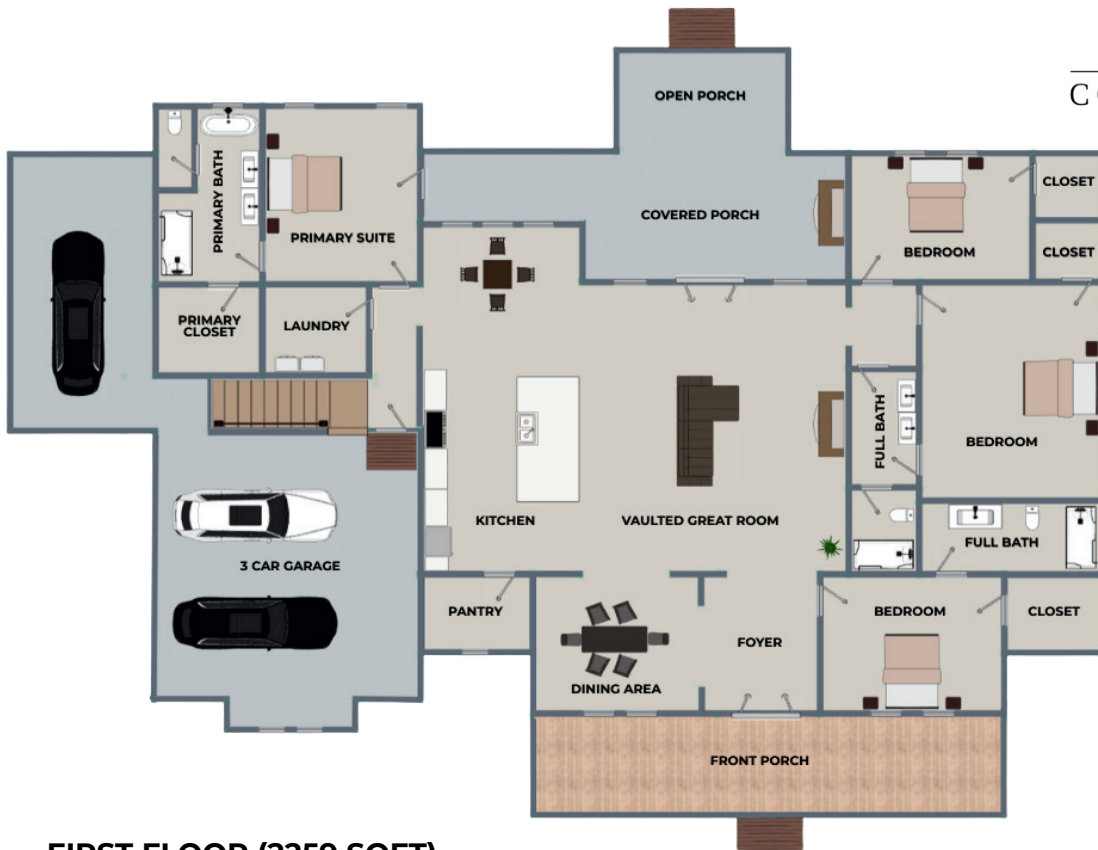
FIRST FLOOR (2259 SQFT)